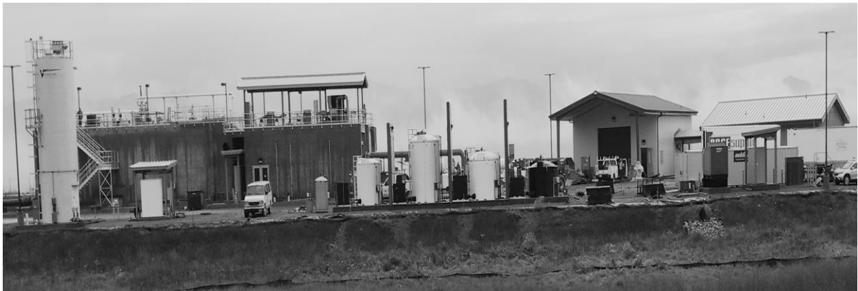
West Hills Surface Water Treatment Plant Construction