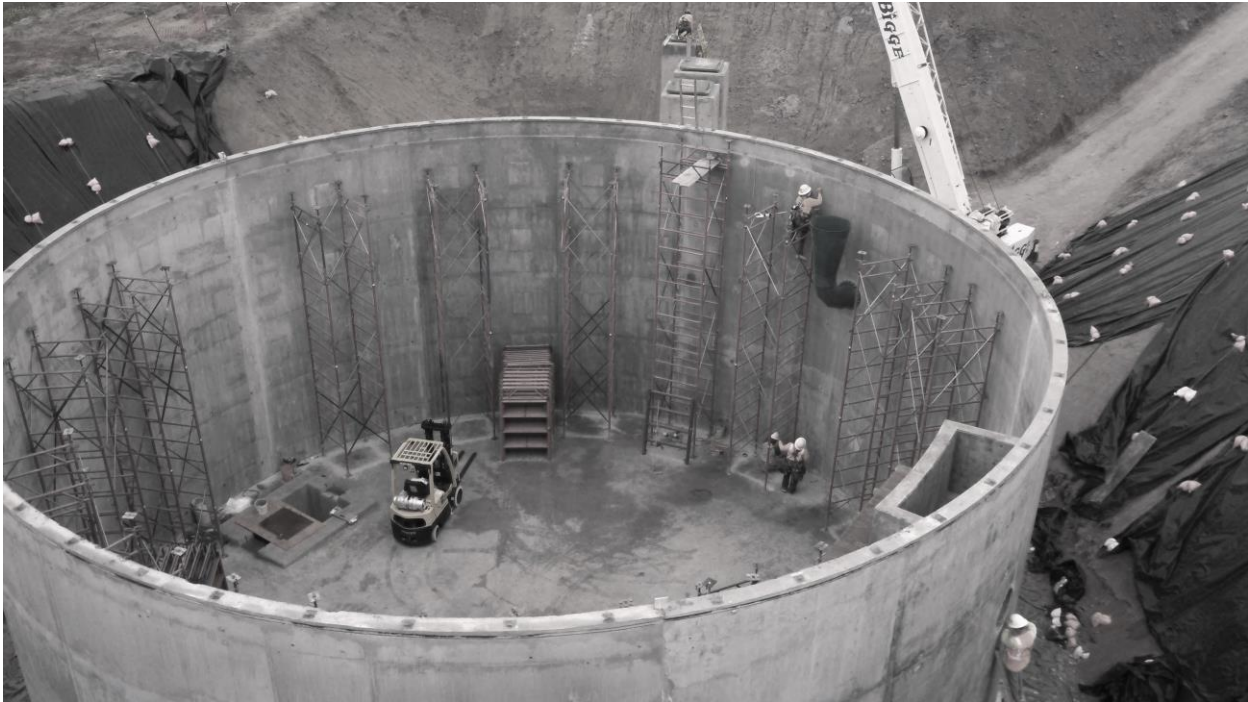
West Hills Surface Water Treatment Plant Construction